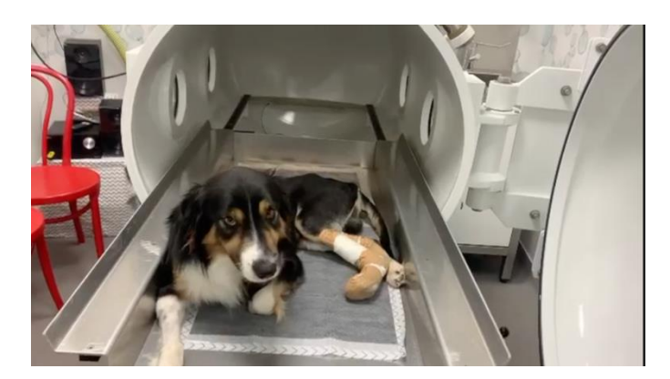
Figure 2. Dog placement inside the hyperbaric oxygen chamber.

The number of sessions was decided according to the needs of each animal, whilst respecting the checklist of minor and major side effects. A rule of at least two treatments per animal was implemented. The first session had a longer treatment phase, and the HBOT